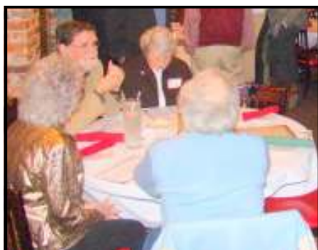
Christmas party photos by Ross Gore