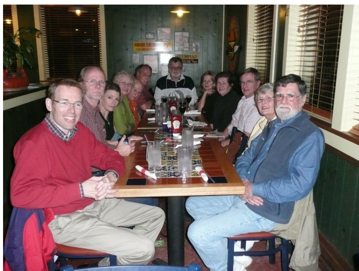
Friday Night Dinner

The Rangefinder is a publication of the Houston Camera Club, Houston, Texas.