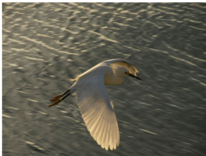
Bird No. 8