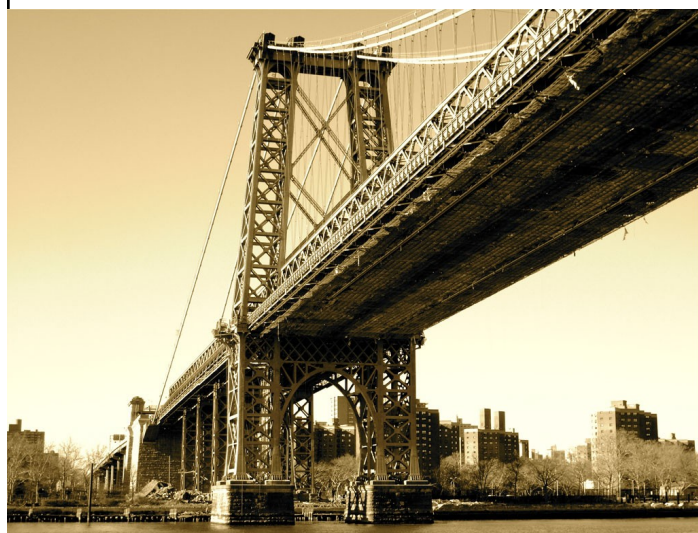
The Williamsburg Bridge