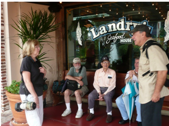
Waiting For Everyone To Arrive