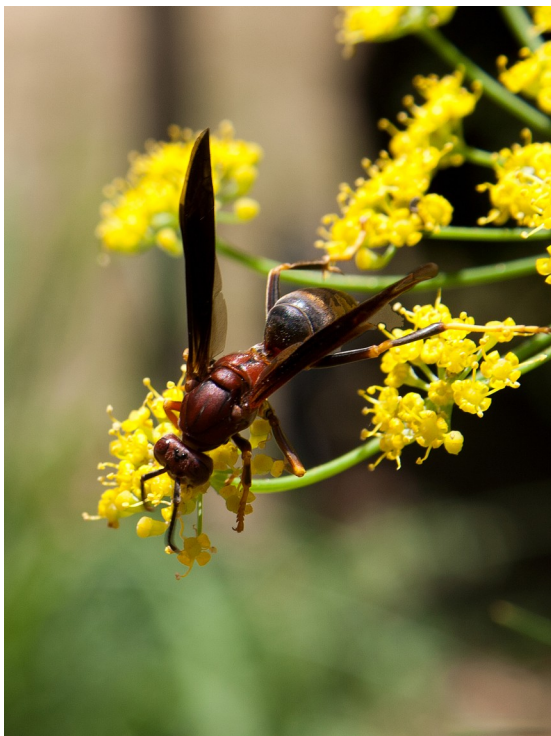
Bee On Yellow Flower