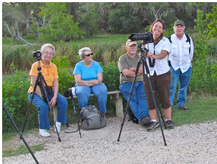
Waiting For The Moon To Come Up