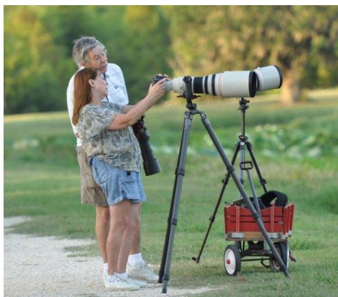
Big Lens Power