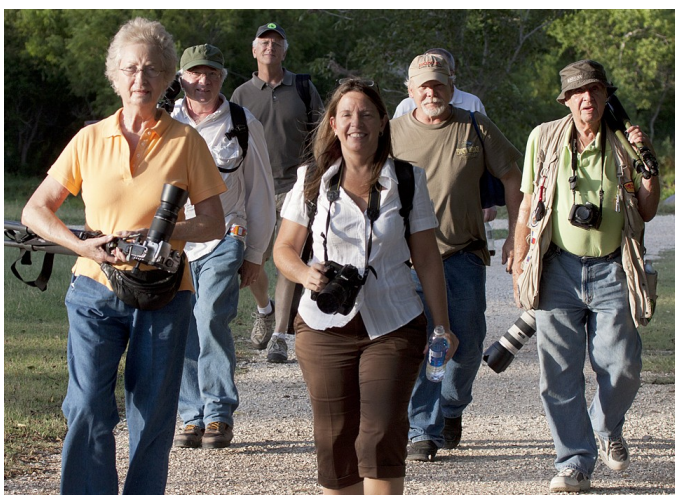
Not Much Further To Go