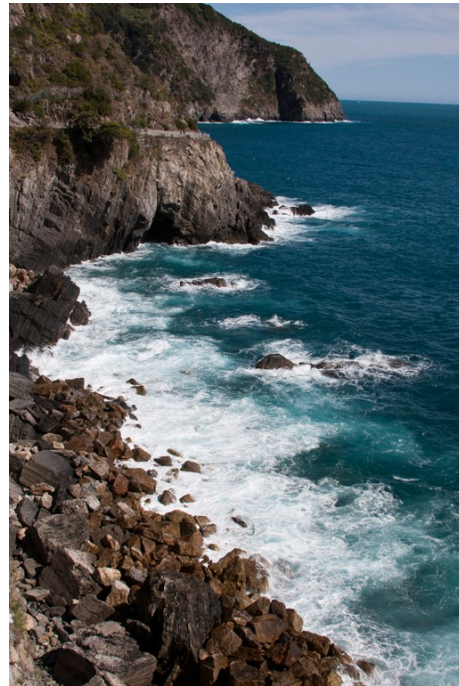
Cinque Terre Coast