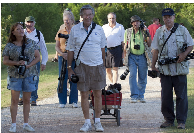
Hiking To Site Along Path