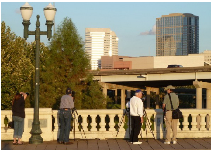
Waiting For Sunset