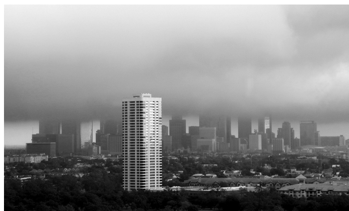
Clouds Over Houston