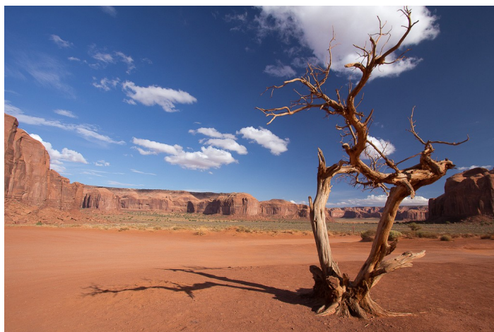
Dead Tree—Monument Valley