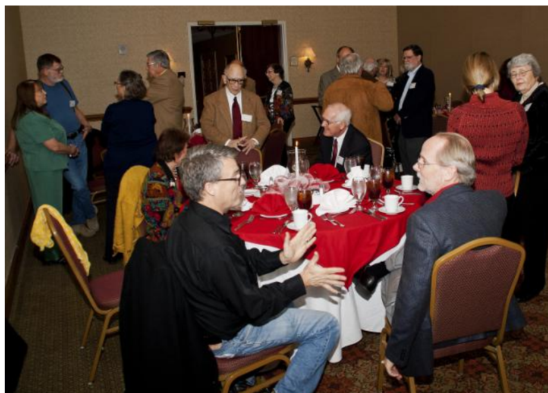
Dinner Attendees