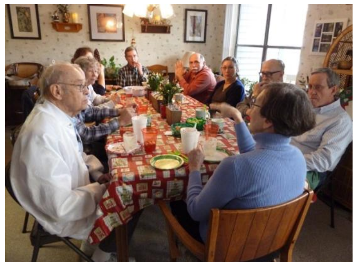
Coldspring Field Trip—Lunch at Jump's Lake House

Additional details will be available in February, 2012. The conference is open to all. You don't need to be a member of PSA to attend. It's not too early to make plans.