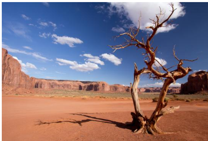
Dead Tree, Monument Valley