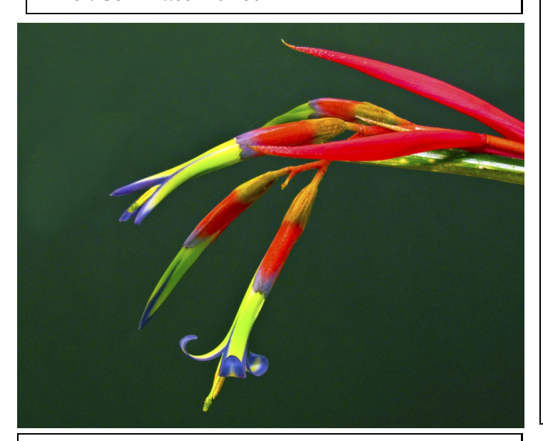
Exhibit Committee Member