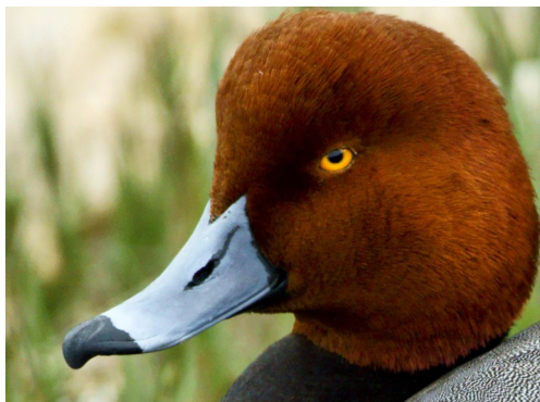
Red Headed Duck Close-up