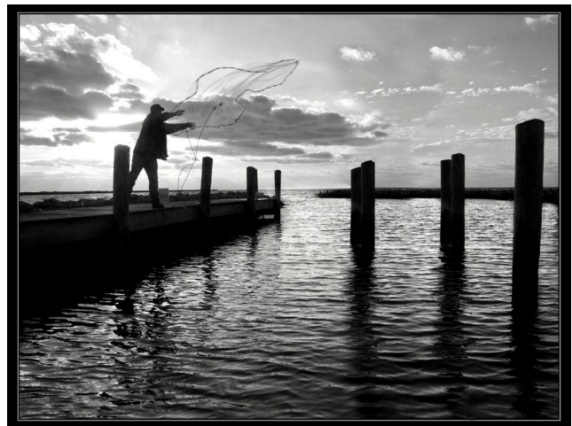
Fishing At Dawn