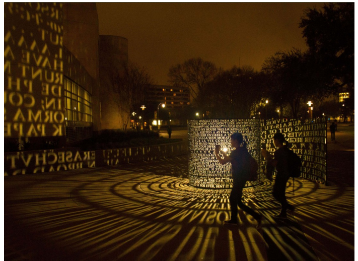
By: Thejas Rajaram