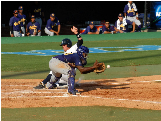
Play At The Plate

August Fireworks September Movement October Three