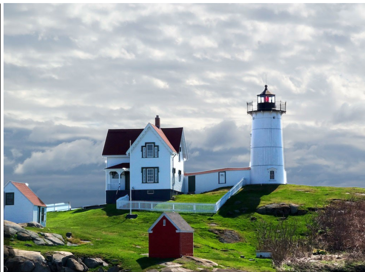
Cape Neddick Lighthouse