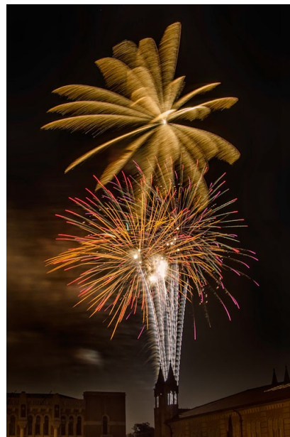
Spewed Fireworks