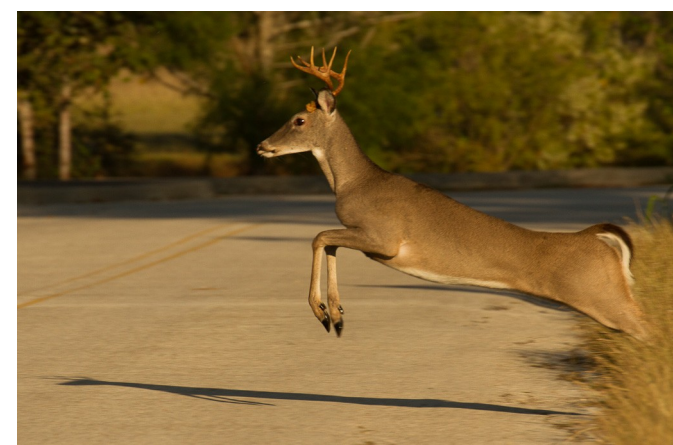
Armand Bayou Nature Center Resident