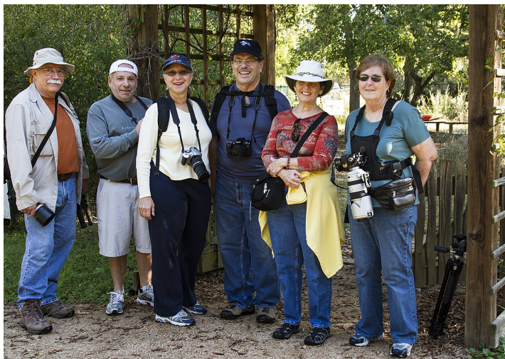
Armand Bayou Field Trip Attendees