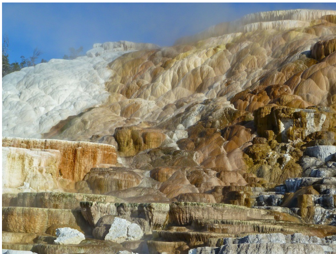
Mammoth Hot Springs