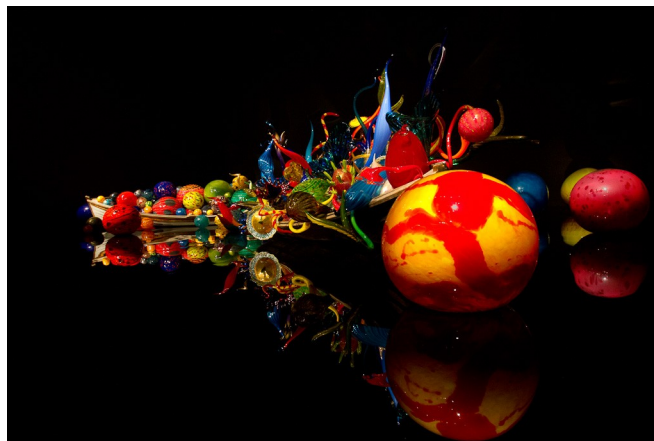
Chihuly Glass Museum