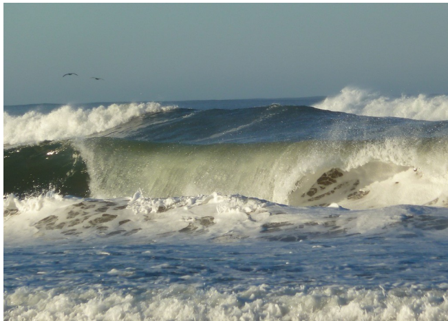
Wave Power and Beauty