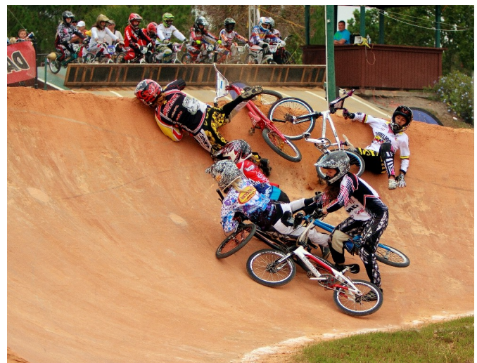
Elete Women Wreck