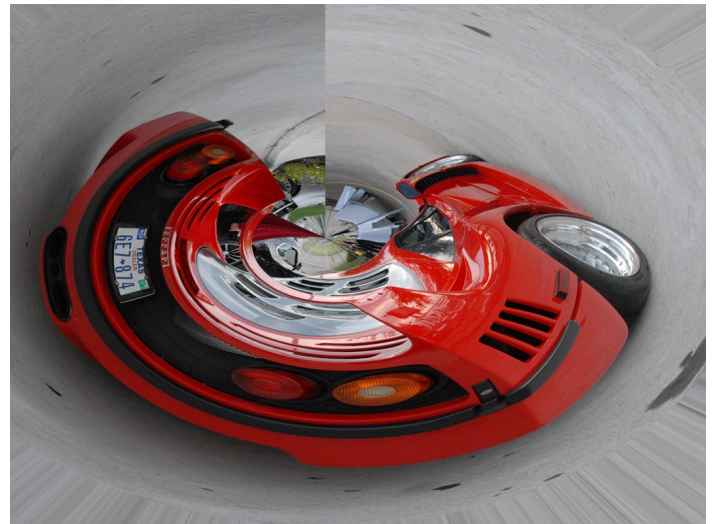
Going Around in My Ferrari