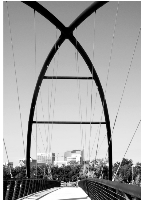
Hermann Park Bridge 2