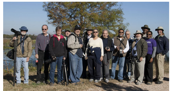
Field Trip Attendees

The Rangefinder is a publication of the Houston Camera Club, Houston, Texas.