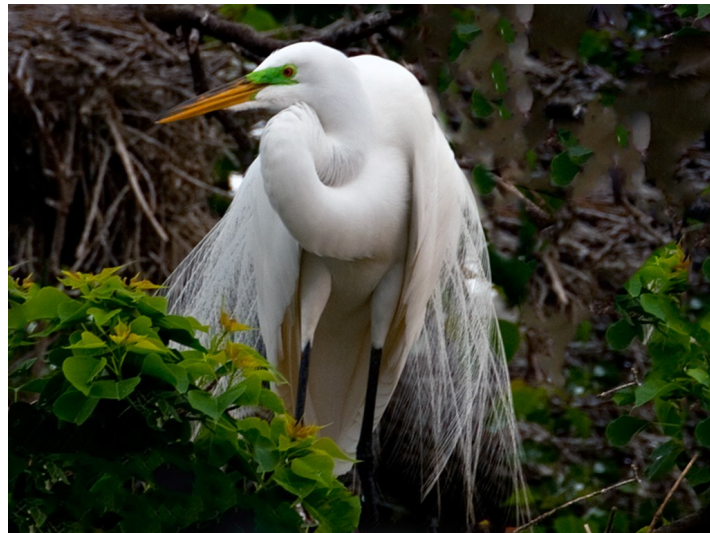
White Egret 9482