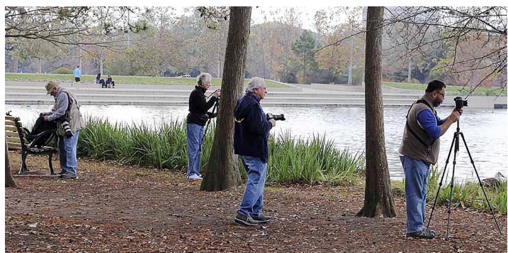
Photographers everywhere surveying the scene