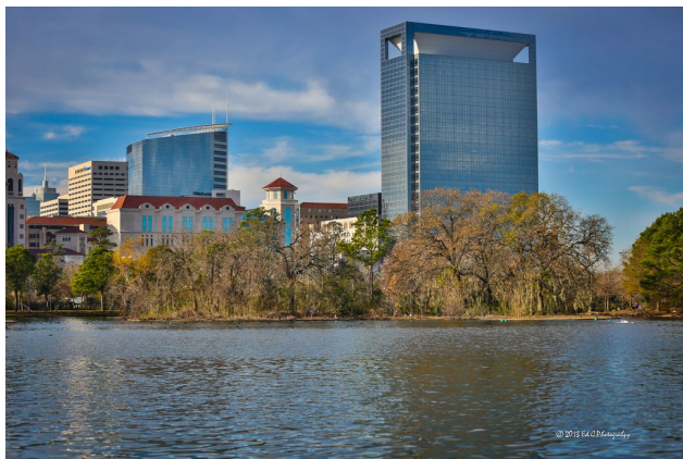
A beautiful day for the field trip.