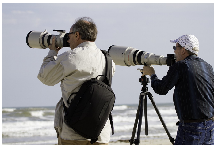
Bring Out the BIG Lenses