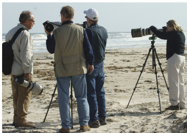
Photography Conference In Progress