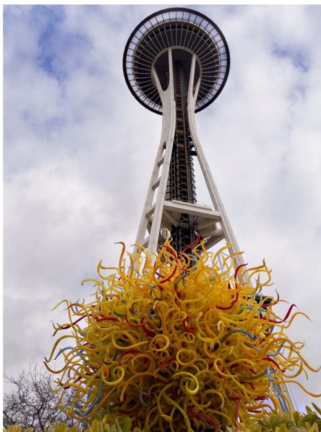
Space Needle Glass