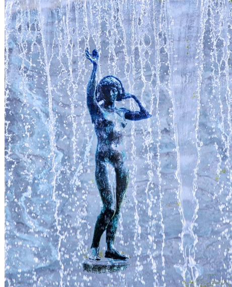
Come On In. The Water Is Fine.