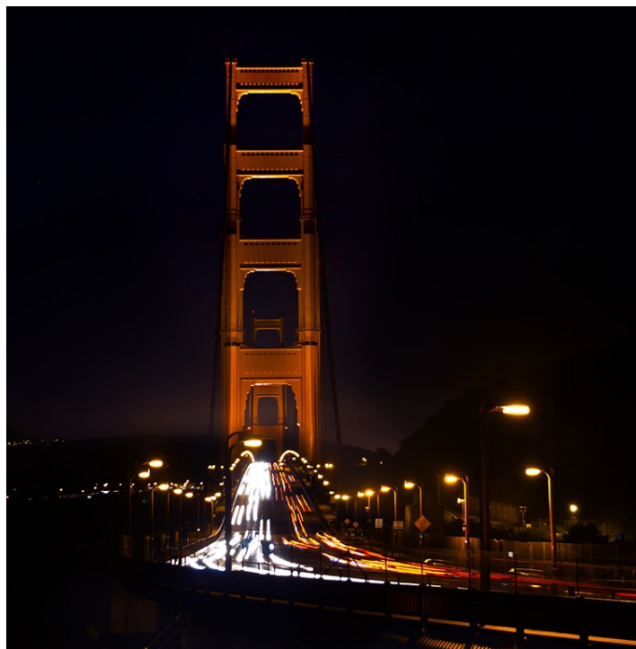
Golden Gate Rush Hour