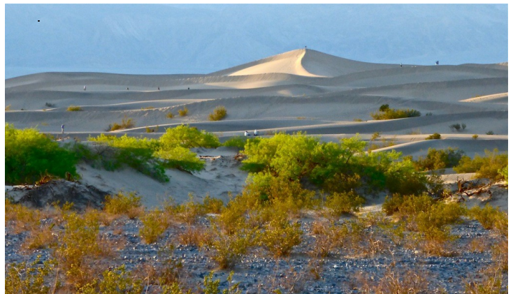
Sand Dune at Sunset