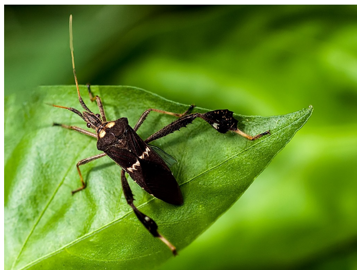
Tomato Leaf-eater 7182