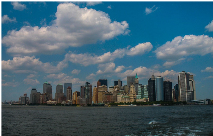
Lower New York