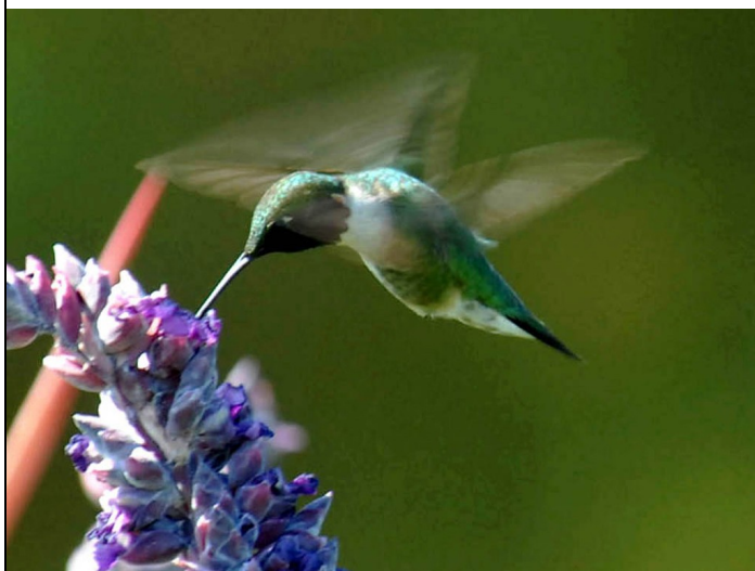
Hummingbird and Flower