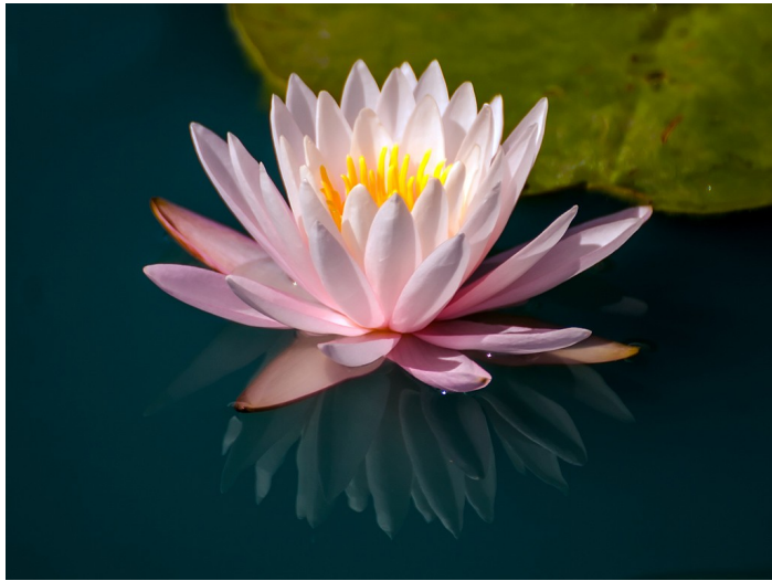
Lily Reflection 8069