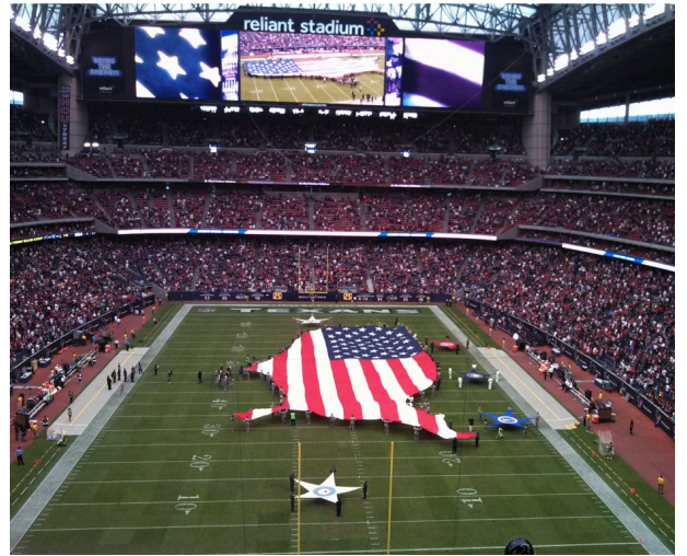
A Pre-Game Show