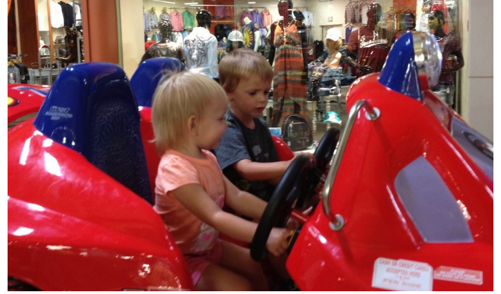
Shopping is Fun!