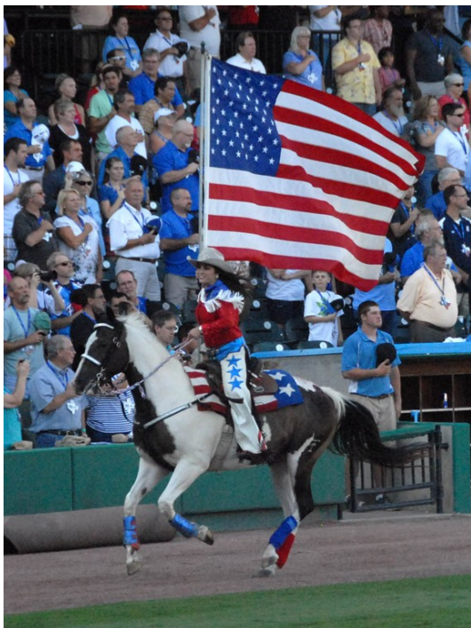
The Rider and Flag

The Rangefinder is a publication of the Houston Camera Club, Houston, Texas.