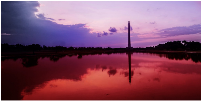
Dawn at San Jacinto