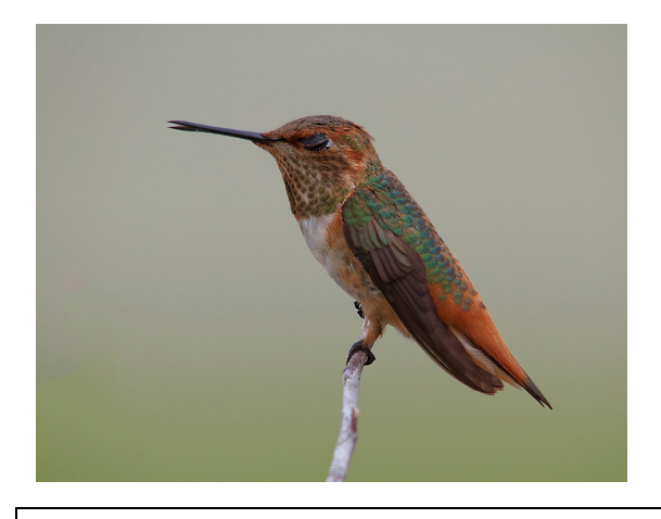
Sleeping Rufus Hummer