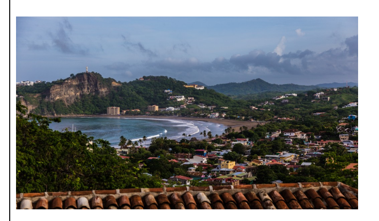
San Juan del Sur, Nicaragua