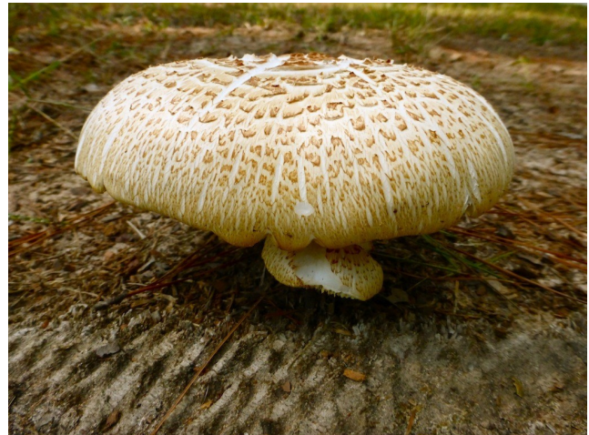
A Cupcake Mushroom