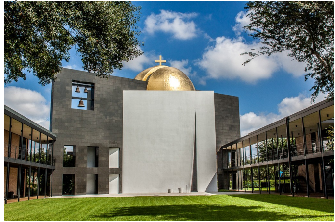
Saint Thomas Church