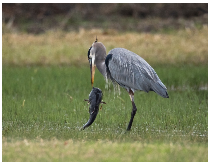
Too Big For Me