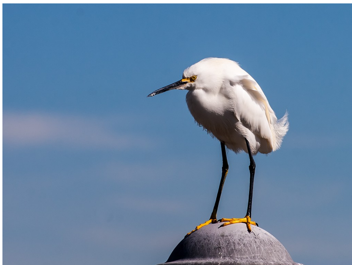
On the Water Pump