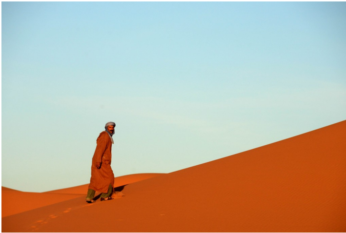
Man Climbing Dune