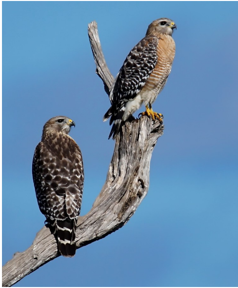
Red Shouldered Hawks