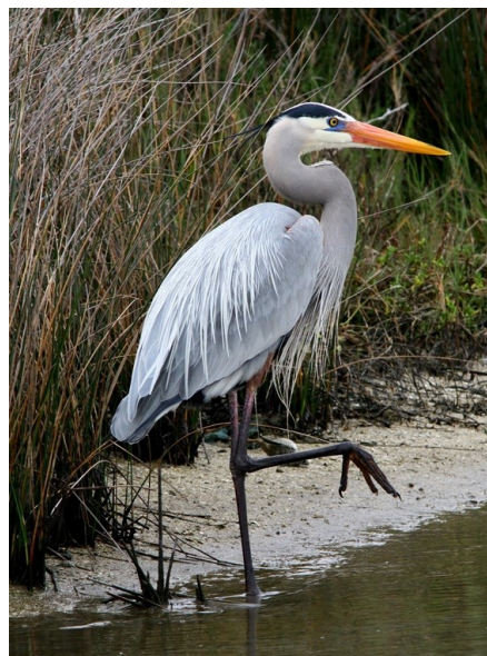
Blue Sneaky Step By: Julius Klehm

The Conference has an exciting lineup of photo tours, workshops, programs, featured speakers and social activities. More detailed information can be found on the PSA website, www.psa-photo.org under the “PSA Conference” tab.