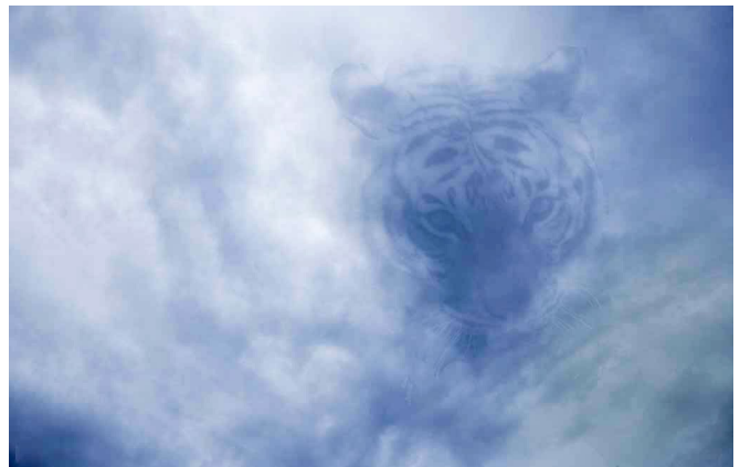
Tiger in Clouds 2