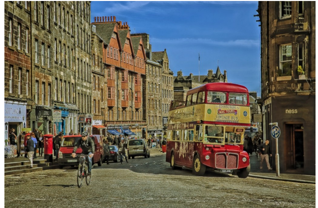
Conor Street in Edinburg