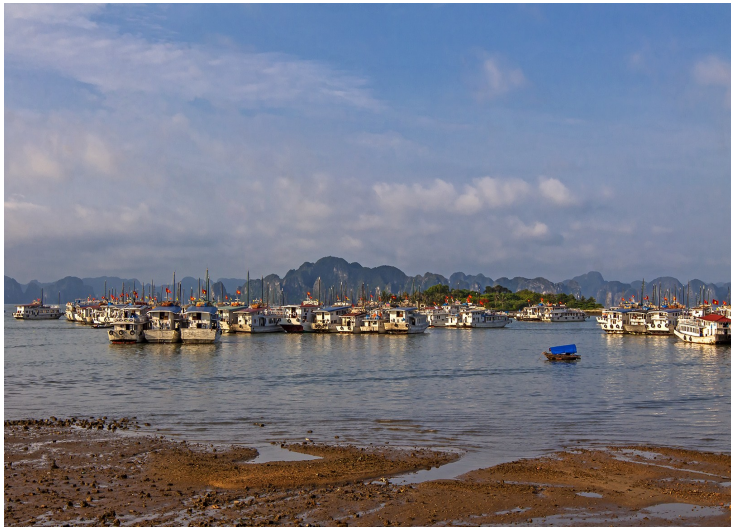
Ha Long Bay VN