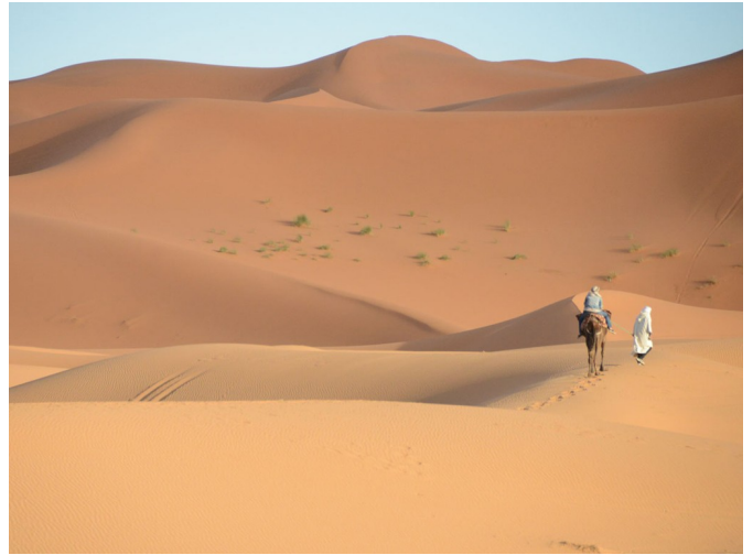
Travelling through Moroccan Desert