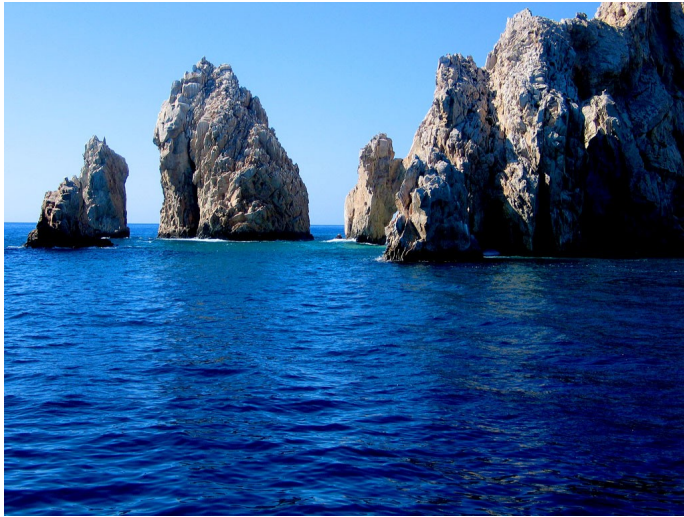
Cabo San Lucas Rocks