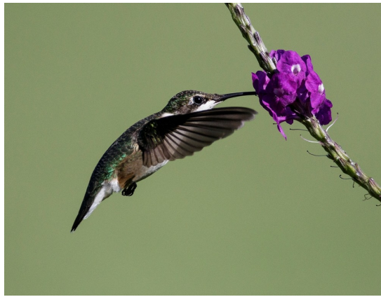
Hummingbird on Wild Flower By: Marilyn Holloway