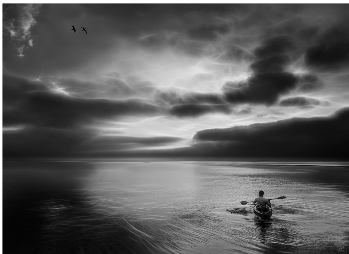
Catching the First Light