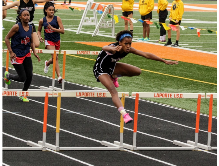
Determined to Win

We all like the refreshments provided by club members. And, we need volunteers to bring them on an ongoing basis. Everyone should take a turn. Do your part. Please add your name to the signup sheet for a convenient meeting. If no one volunteers, there won't be any refreshments.