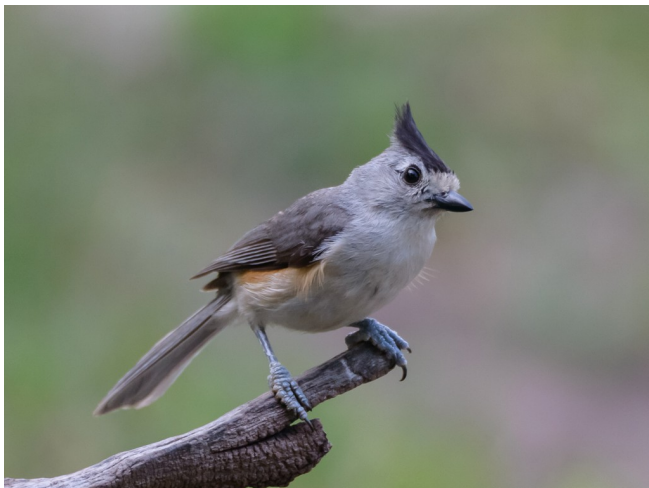
Black Crested Titmouse 7218

This year's conference will be held September 10 through September 17 at the Wyndham San Antonio Riverwalk. For more information, look at the PSA website psa-photo.org and then click the Conference tab at the upper right.