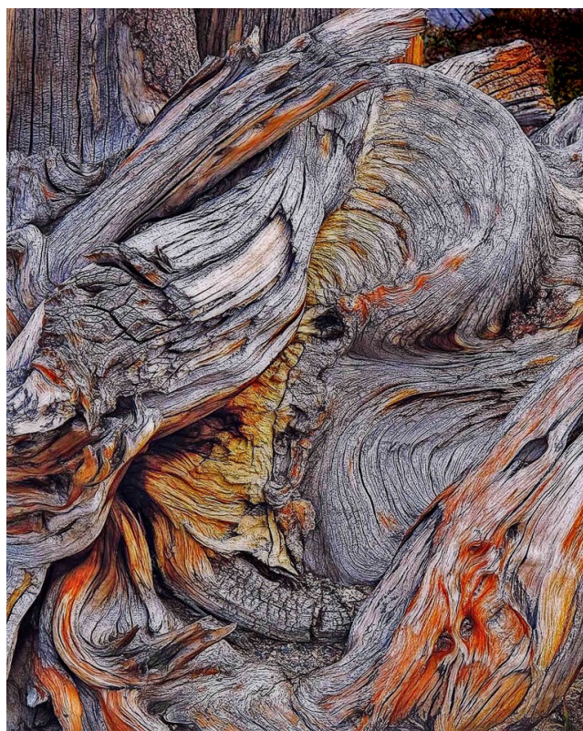
Bristlecone Pine Root