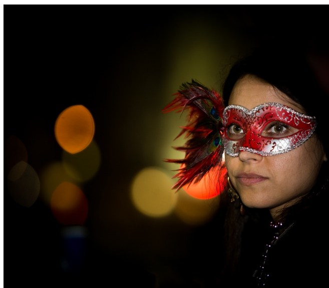
Mardi Gras Reveler