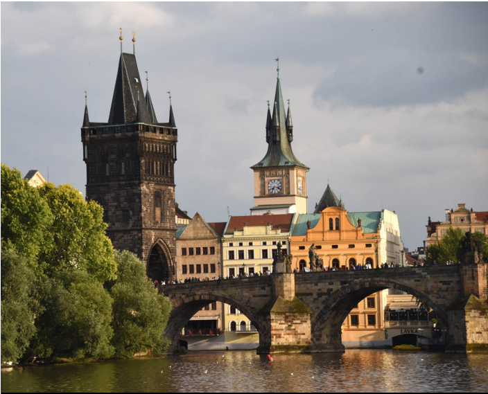
Prague and the Charles Bridge

July Beach Scene Whatever you come across on your next trip to the beach