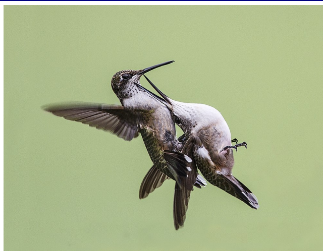
Juvenile Hummingbirds Fighting