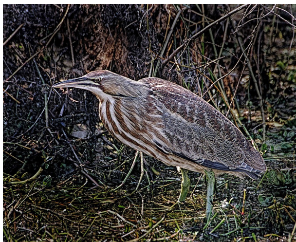
American Bittern