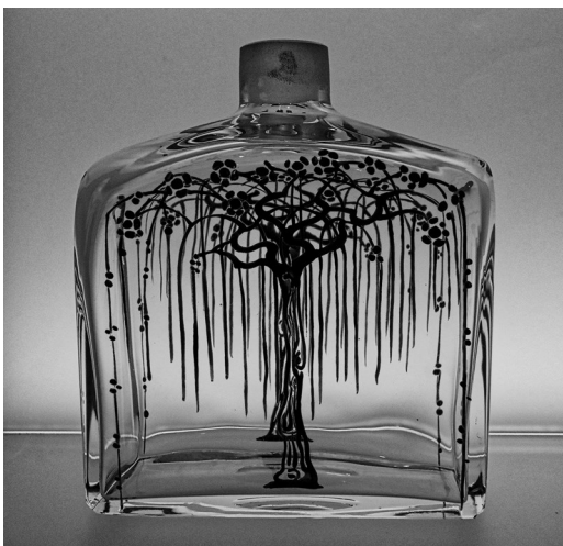
Vuitton Perfume Bottle By: Urvine Atkinson