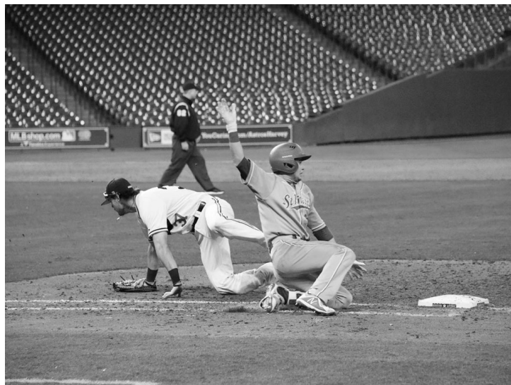
Slide into First