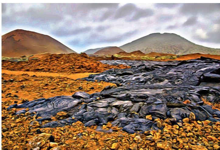
Cinder Cone Flow