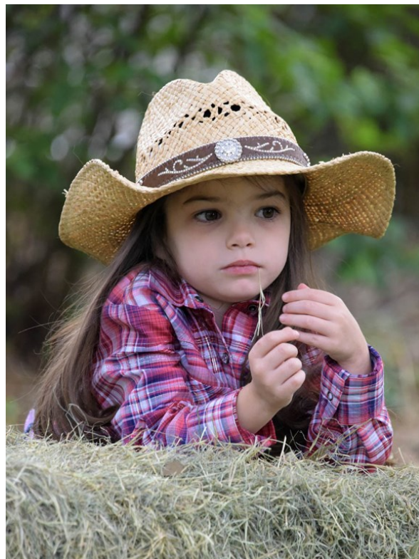
Little Cowgirl Closeup