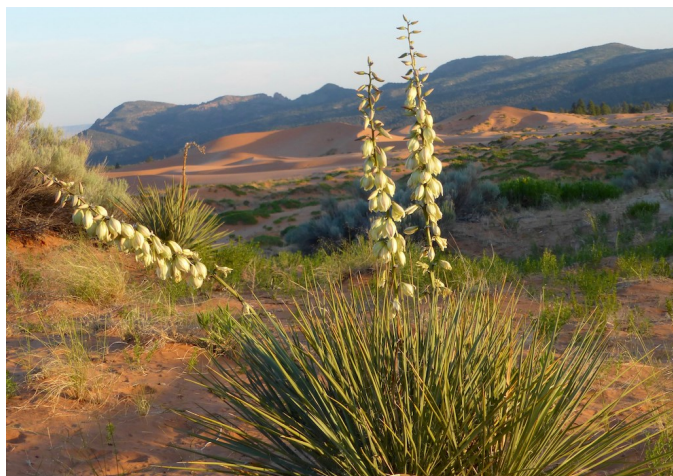
Coral Sand Dunes