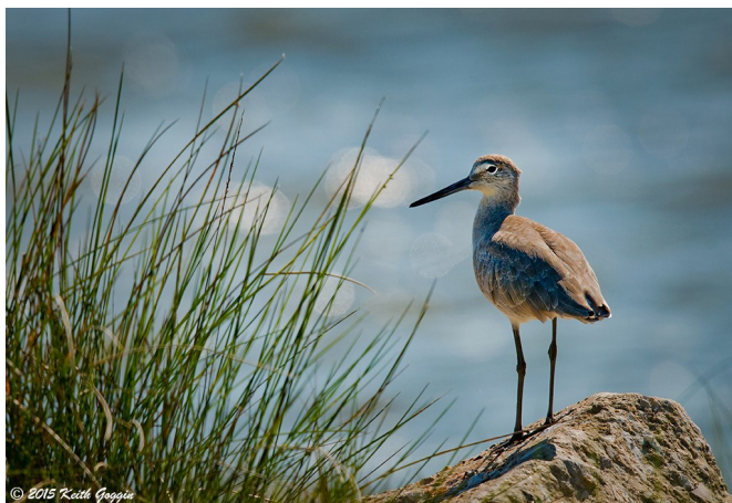
Willet Winter Plumage