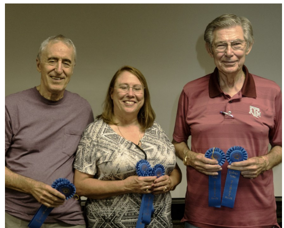
2017—2018 High Point Winners