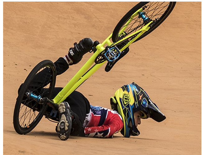
Bit the Dust

Registration is open. On the web site, at the link Register for this Event, you can register. Registration cost is $210. The Conference hotel is the Sheraton Salt Lake City Hotel, 150 West 500 South, Salt Lake City, UT 84101.