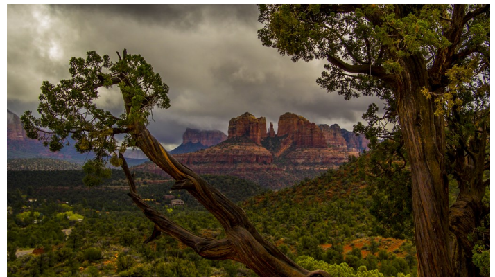
Storm Over Sedona