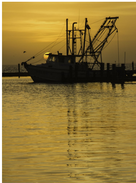
Peaceful Sunrise