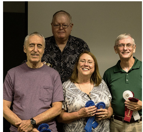
2017—2018 Year-end Winners

The Rangefinder is a publication of the Houston Camera Club, Houston, Texas.