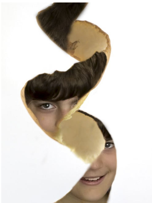
Skin Peel By: Buz Cabral