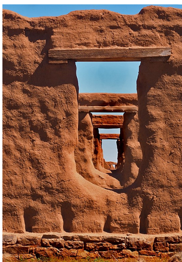
Storehouse Windows at Fort Union, NM