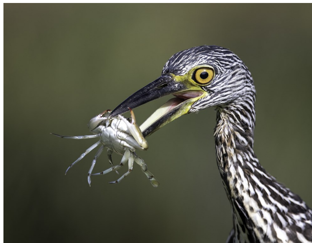
Night Heron's Crab Supper

Registration is open. On the web site, at the link Register for this Event, you can register. Registration cost is $210. The Conference hotel is the Sheraton Salt Lake City Hotel, 150 West 500 South, Salt Lake City, UT 84101.