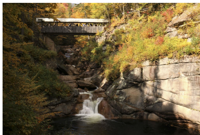
Covered Bridge in White Mountains

The Rangefinder is a publication of the Houston Camera Club, Houston, Texas.