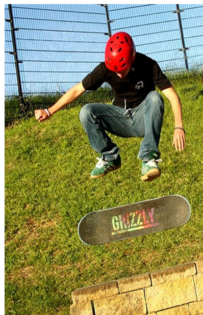
Skateboarder