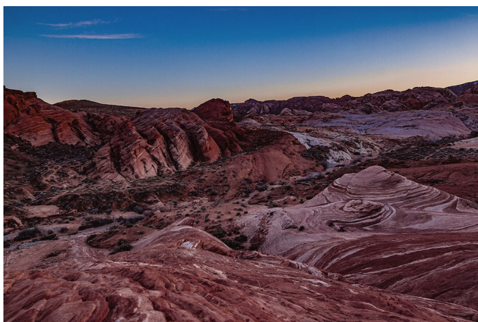
Valley of Fire State Park