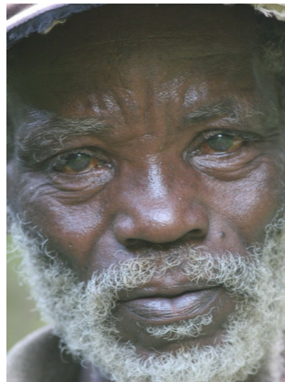
Age