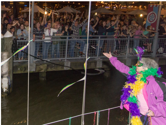
Throwing Mardi Gras Beads