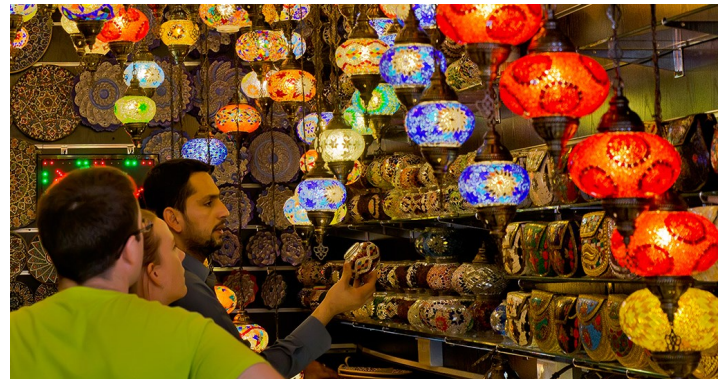
Guided Shopping in Dubai