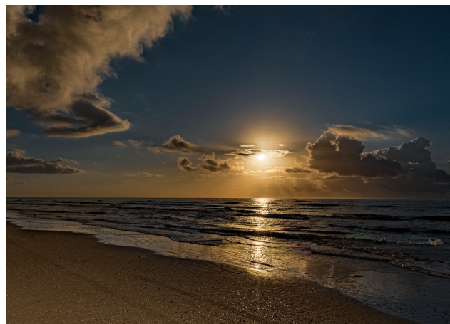
Bolivar Peninsula Morning