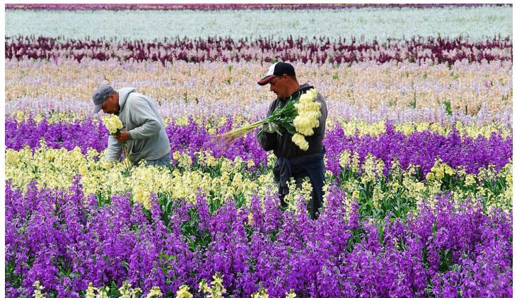
Cutting Phlox Near Lompoc