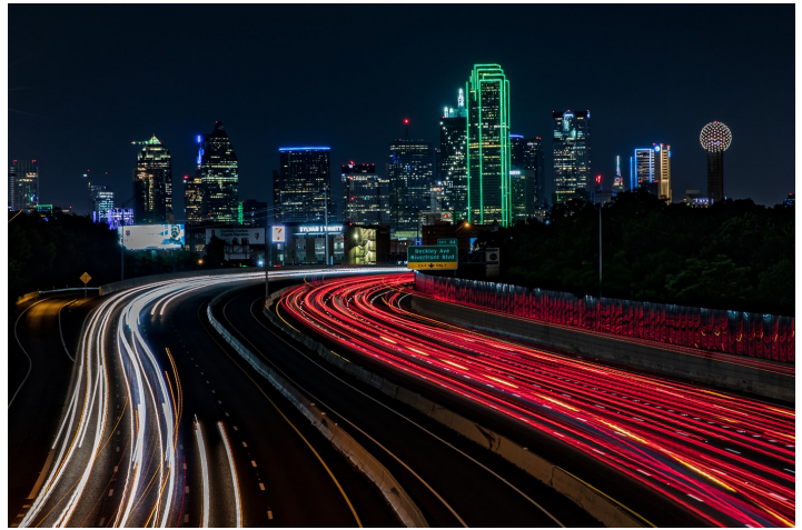
Coming & Going From Dallas