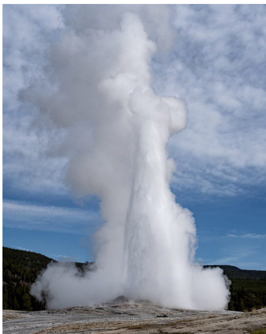
Old Faithful