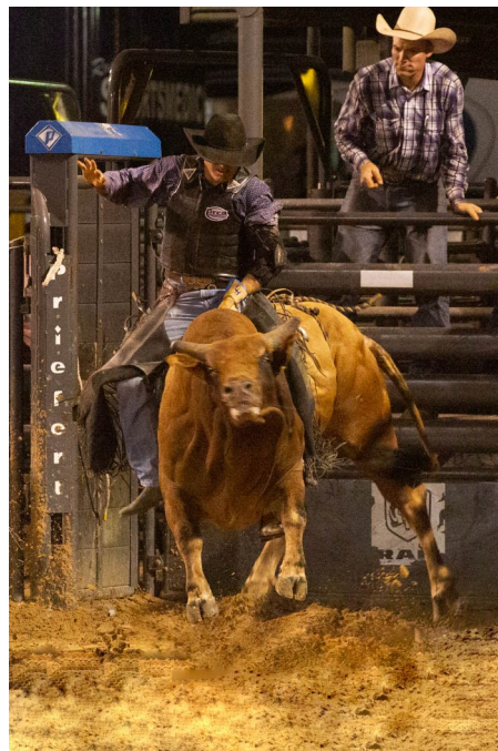
The Start of a Five Second Ride By: Terry Rutledge

Each maker may submit one print. Pictorial print rules apply. Images will be judged outside the club.