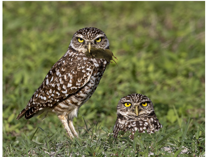
Burrowing Owl Brings Lunch Home