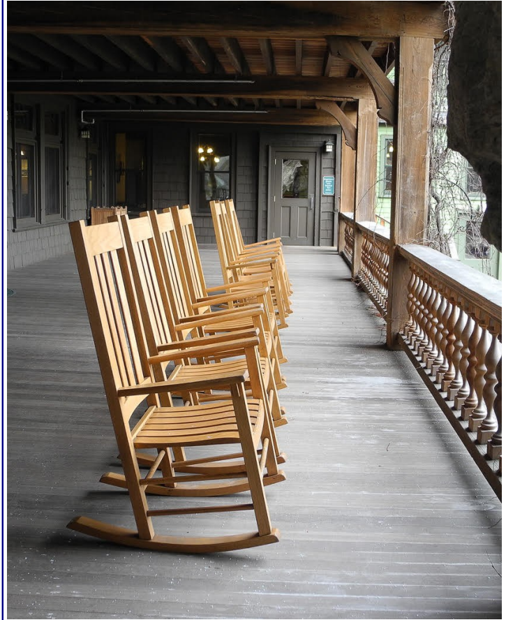
Waiting For You