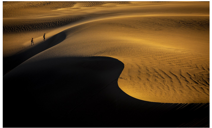
Lost in the Desert

If you have been able to get away for a few days of photographic fun, please let us know. We would like to share it with everyone. If you are staying closer to home, let us know how you are passing the time.