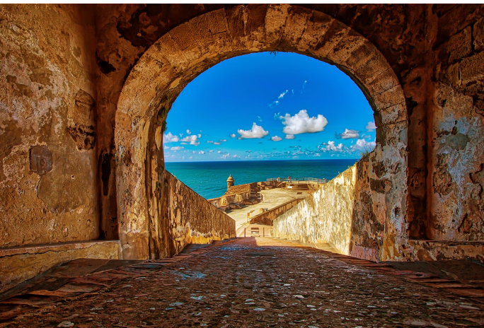
Castillo San Felipe de Morro