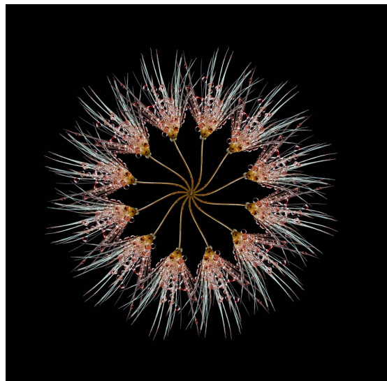
Circle of Clocks