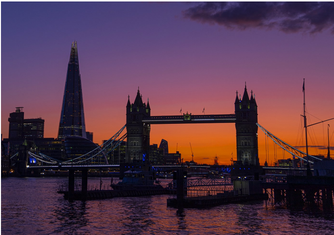
Tower Bridge at Sunset

The images will be judged outside the club and the winner will be announced in December. The winner will have his/her name engraved on a permanent plaque. The winning image will be displayed in the Bayland case.