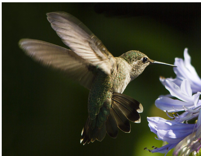
Hummingbird Is Ready