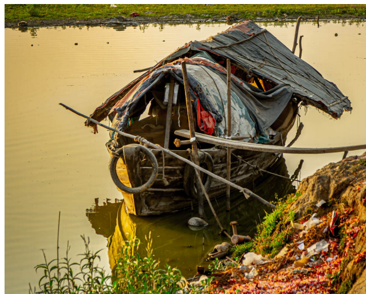
Home, Sweet Home