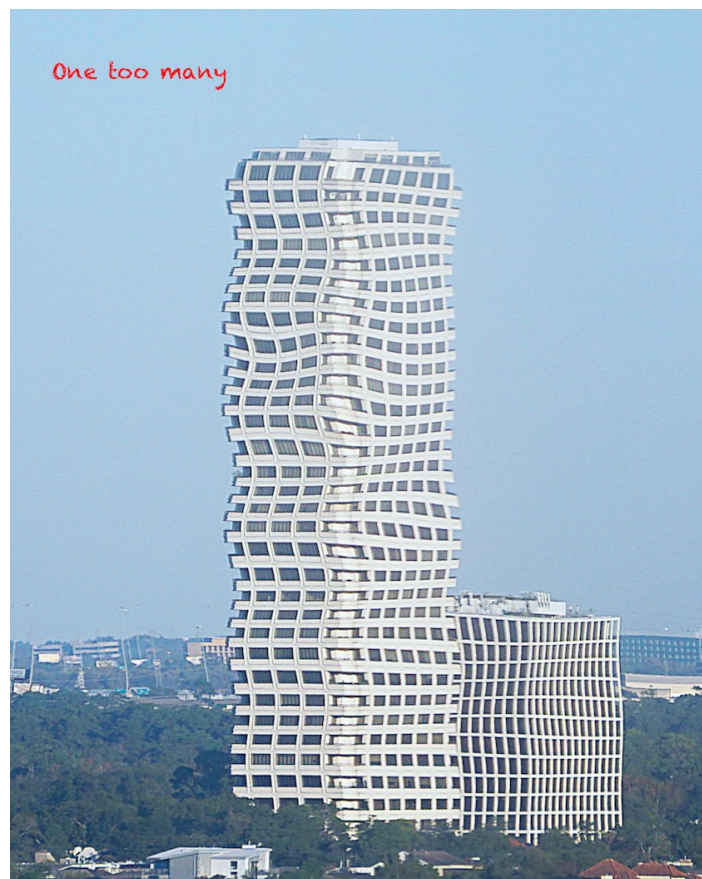
One Too Many