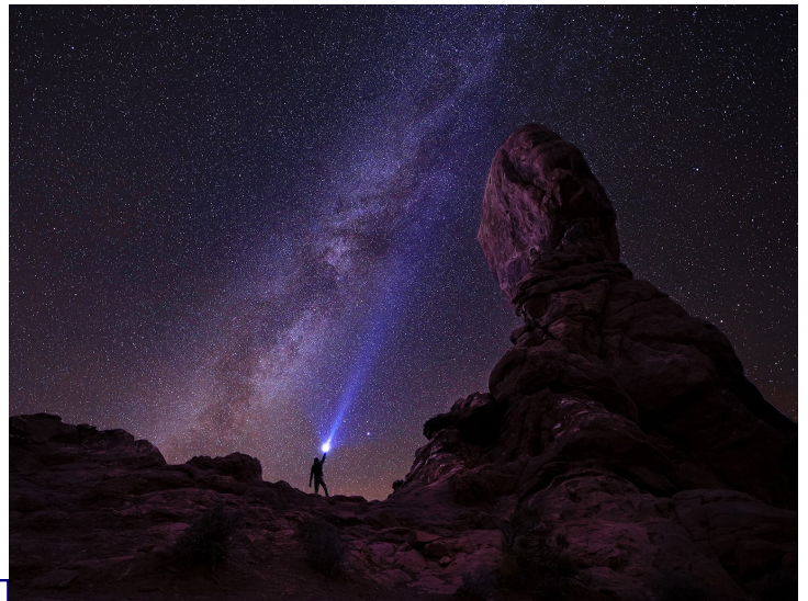
The Night Begins To Shine