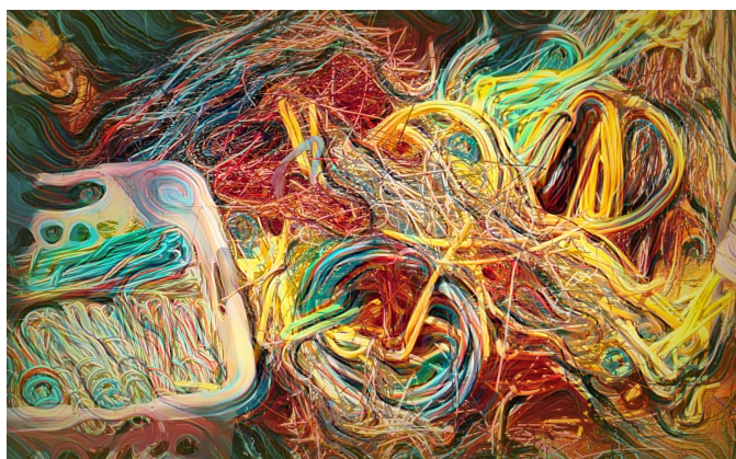
Copper Wire Collector