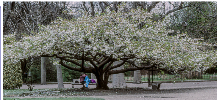
Aaaah Springtime in Paris