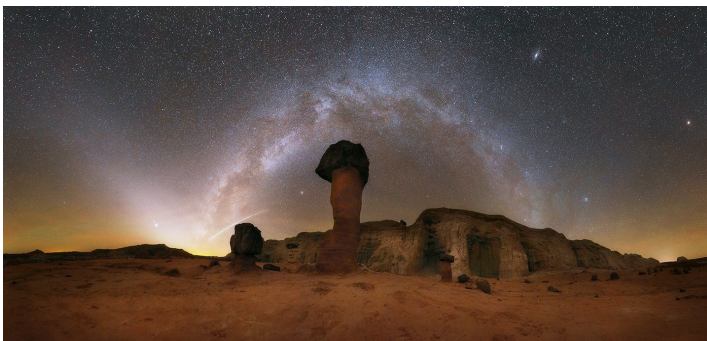
The Night Sky Party