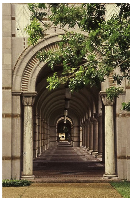
Hall At Rice U